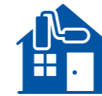
Property Maintenance Solutions