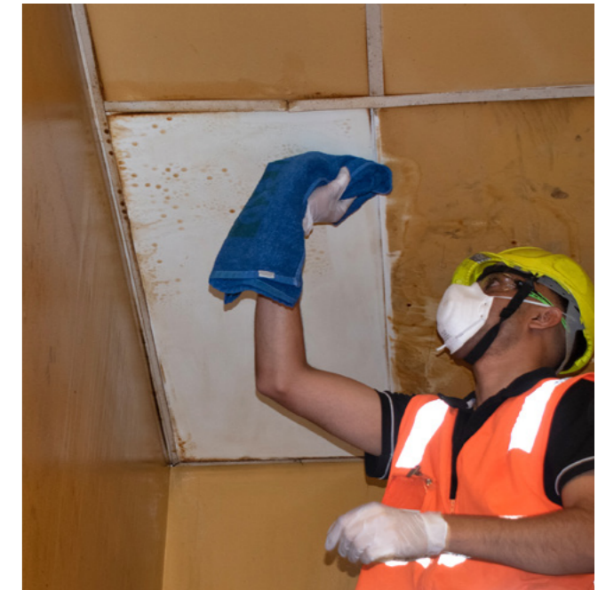
A prime example of the effectiveness of the Waterless Cleaning System. The products breaks down grime and grease leaving surfaces in pristine condition.