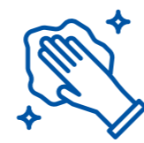
Waterless Cleaning System