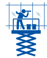
Exterior Building Washing