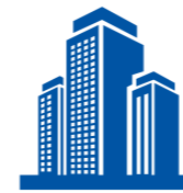
Summit Automated Wash Systems